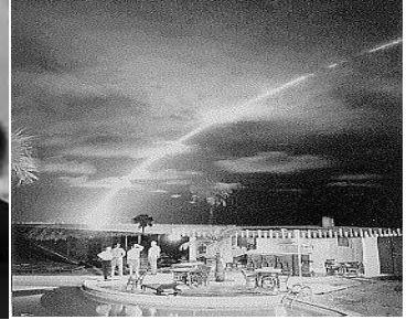
Watching a missile test launch

1961 - Soviet Union places first man in space, Yuri Gagarin