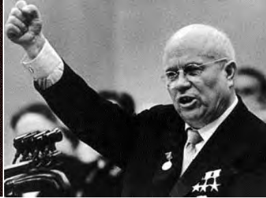
Soviet leader Nikita Khrushchev