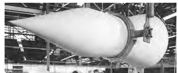
Minuteman II Warhead