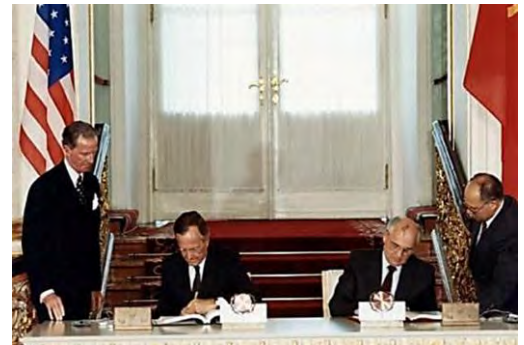
Signing of START Treaty in 1991

1999 - Minuteman Missile National Historic Site designated