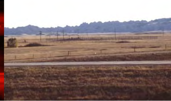
Mutually Assured Destruction Under a Peaceful Prairie