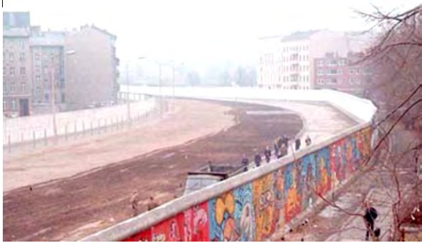
The Berlin Wall: Symbol of a Divided Europe