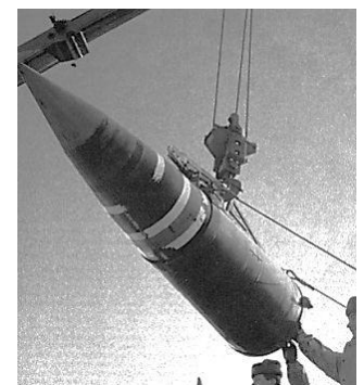
SS-18 Satan Warhead

The buildup of nuclear weapons was one way the Cold War was fought. Between the opposing sides, over 80,000 nuclear weapons were constructed. While none of these were detonated in a hot war, over 1,800 tests were conducted. The arms race nearly led to World War III several times, one of which was the Cuban Missile Crisis in 1962. At one point, the world’s nuclear stockpiles totaled a chilling 18,000 megatons. By comparison, the entire explosive force of all the bombs used during World War II was 2 megatons. Reflecting on the impact these weapons could have on the world, former U.S. Secretary of Defense Robert McNamara once said, “nuclear weapons have no military utility whatsoever, except to deter an enemy attack.”