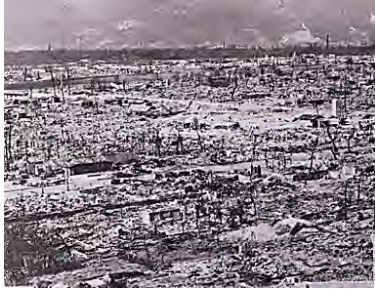
Destruction at Hiroshima