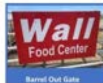
Barrel Out Gate