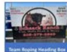
Team Roping Heading Box