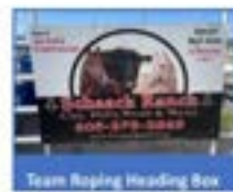
Team Roping Heading Box