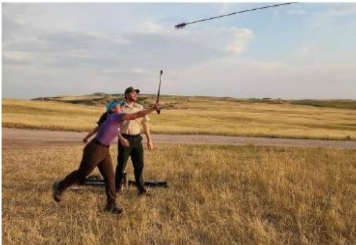
Photo 2: NGVC Interpretive Ranger shows an Atlatl Program participants how to throw an atlatl.

Throughout the summer the NGVC Interpretive Rangers have been hosting an Atlatl Program at Pinnacles Designated Dispersed Camping Area on Buffalo Gap National Grassland. Through this ranger led program participants learn about survival on the Grasslands and how an ancient hunting tool evolved. After the program participants have an opportunity to try their hand at using an atlatl, a spear throwing device. This program occurs every Friday night at 7 PM with the last program being on September 6 th . Pinnacles Dispersed Camping Area is located approximately 7 miles south of Wall, SD off of Highway 240. The location of the presentation is near the communication towers at the intersection of Forest System Road (FSR) 7170 and FSR 7158. GPS coordinates: 43.893234, -102.229143