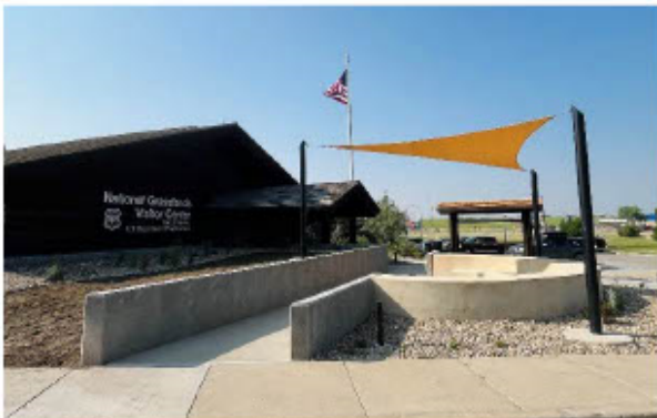
Photo 1: The NGVC after most of the exterior renovation has been completed. This photo shows the new shaded amphitheater, landscaping, flagpole, and kiosk.

The Grand Re-opening comes after renovations closed the NGVC temporarily. The most recent renovation occurred after the NGVC received funding from the Great American Outdoors Act (GAOA). GAOA was established to help with improvements to existing infrastructure on federal public lands. The exterior improvements include a small shaded amphitheater, animal trackway in the walkways leading up to the NGVC, a fossil exhibit wall, new interpretive signage, picnic table area, and native plants added to the landscaping. Most of the work is set to be completed this month with some of the exhibits and signage still in the development phase. The NGVC is set to be open to the public starting Monday, July 22 nd .